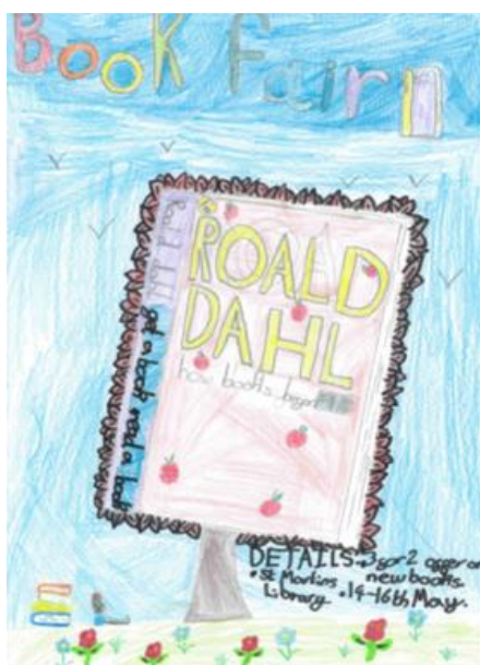
Liv from Poplar class