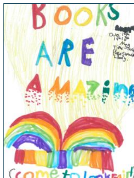
Deana from Holly class

These wonderful posters will be hung around the school. We also have Book Fair bookmarks for all children that would be interested, with all the details of opening times and dates.