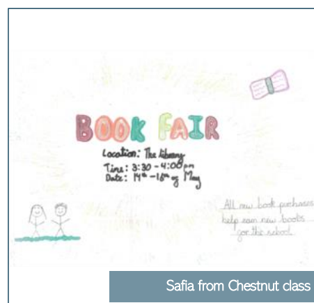
Safia from Chestnut class